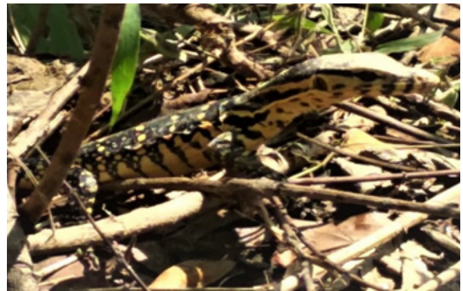
Fig. 2. Varanus salvator in its natural habitat at Saresat Rashi in Faridpur.