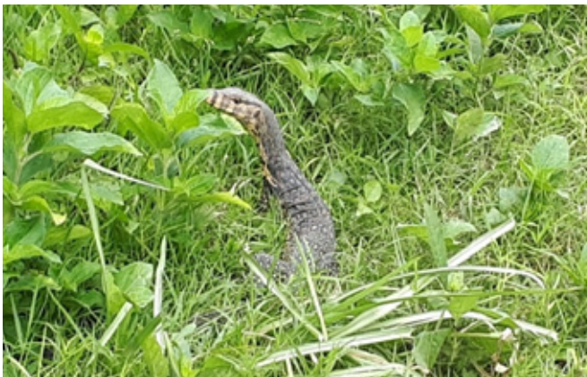
Fig. 1. Varanus salvator in its natural habitat at Duair in Faridpur.