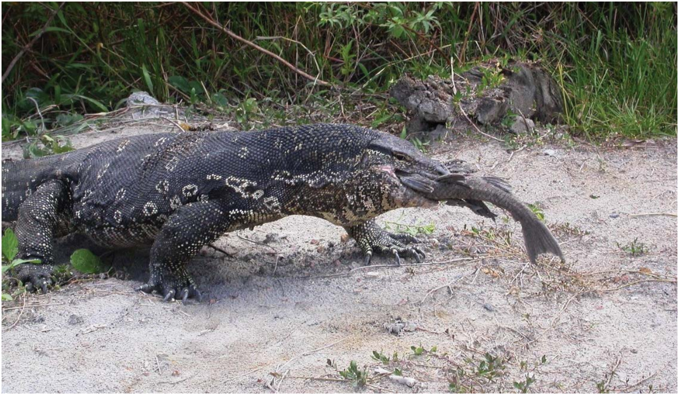
Figure 1. Varanus salvator with captured Hypostomus plecostomus in Bellanwila-Attidiya Sanctuary.